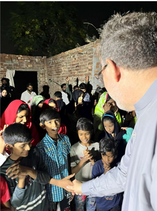
The Church at Bhaiwala

As word about our ministry is spreading, more and more villagers want to come onboard with CMI. Our concept is simple – we want to know one another, to trade stories and to pray together. In short, we are building trust through love. Hardly a day goes by that CMI doesn't receive a request from one or more new villages. While the love is infinite and its supply is refilled by the Holy Spirit daily, the earthly needs are staggering, if not infinite. How do we accept more? How do we decline to love? What are we able to do well? And, how much is too much?