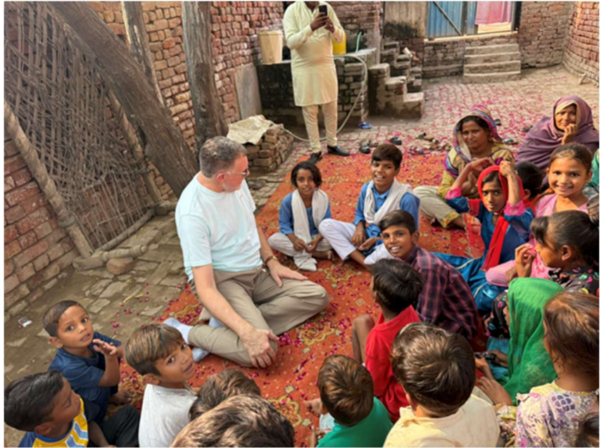
The Church at Dashoa