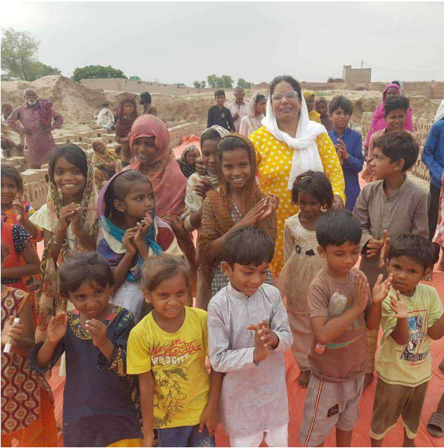
The Church at Gojra